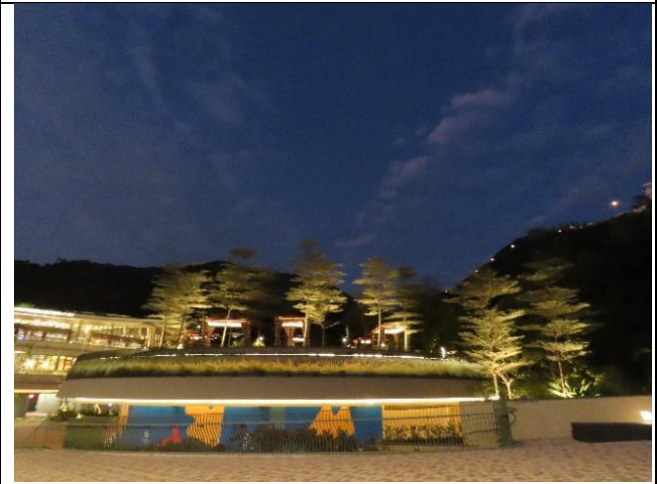
OP06 Responsive Lighting Design – General view of lighting design with appropriate level of lighting to reduce potential impact