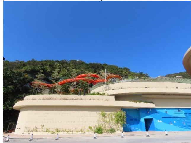
OP04 Green Roofs and Vertical Greening – General view of green roof and vertical green in establishment.