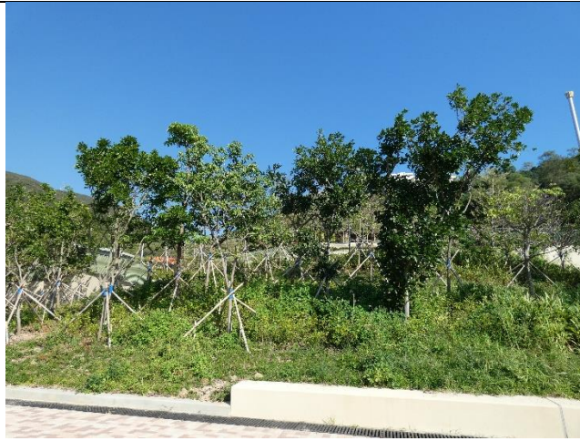
OP02 Compensatory Tree Planting – General view of whip trees newly planted.