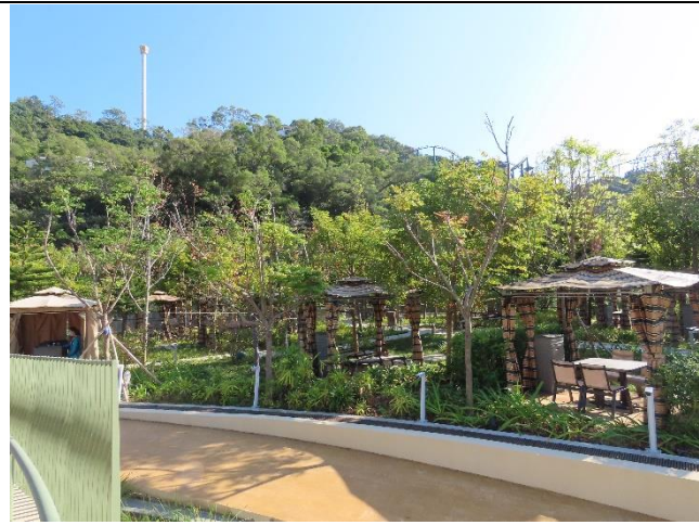
OP01 Sensitive Design and Disposition – Color palette of the design was mostly in subdued tones. Floor and walls were painted with non-reflective finishing.