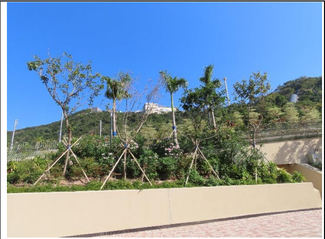
OP03 Enhancement Planting – Additional trees and shrubs were planted along the pedestrian walkway.